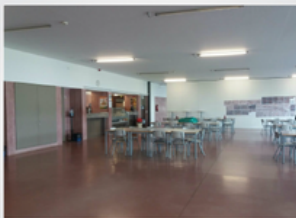
Bar for Breakfast

During the Youth Exchange, the sleeping rooms will be prepared for you to rest.